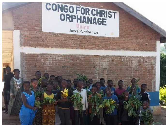
Twenty seven of the orphans at Congo for Christ were baptized on May 20, 2017.

instruments in church. This is really encouraging to see the different talents these kids have and how they are using them to glorify the name of the Lord. We also thank God because 27 of our kids requested to be baptized, and so the CCC board requested the church to carry on the baptism service for them."