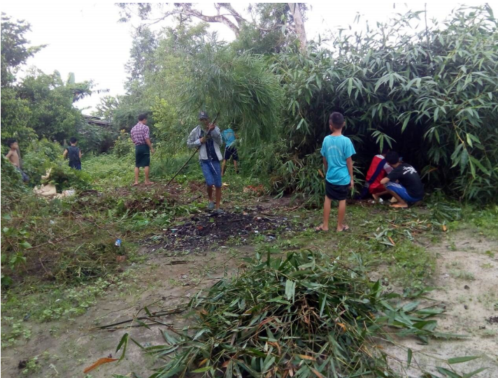
Children clearing the land purchased by Global Outreach.

Earlier this year we shared the need for House of Refuge to add adequate living space to accommodate the growing family of children they care for. We are happy to say a new building has been completed and alleviated the crowded conditions they were experiencing. Since so much of the property is now taken up with buildings, Pastor Cyrus asked Global Outreach to help them purchase additional land adjoining House of Refuge. We were able to send $7,000 and they were extremely grateful to be able to secure more property. The new land is already being used for a garden and agriculture projects. It also provides a safe and secure place for the children to play.