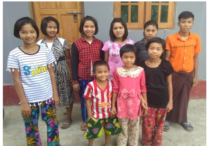
Nine additional children have recently joined House of Refuge