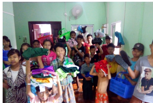
New clothing provided by your donations

We were also able to help these children by sending funds to purchase new shoes and clothing. Pastor Cyrus has shared some other pressing