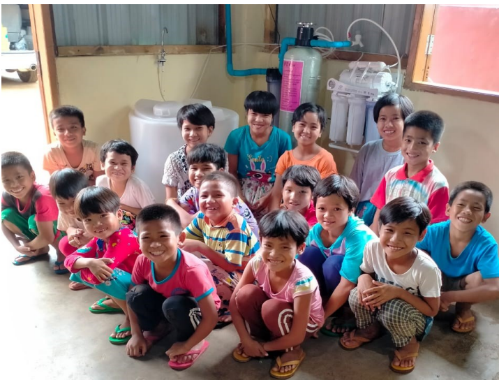
Children at Agape are excited to have clean water to drink! Currently they need a water pump and light to be run by a generator. The military coup has resulted in huge cutbacks of water and electricity. The cost of both items is $500.

with our children. In the years since then, Heidi mar-