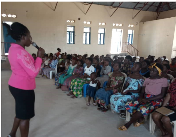
Training for community teen girls at Congo for Christ

After Congo for Christ (CCC) started the feeding program for community children in 2016, it soon became apparent that something was also needed to minister to the teens in the community. Every month more than 300 teens come to the new chapel at CCC for a day long seminar which includes Bible teaching as well as lunch.