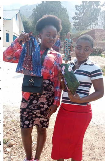
Girls are happy to get kits.