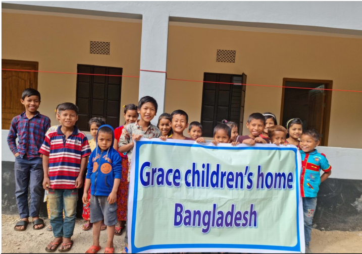
These 17 children are thankful to call Grace their new home.

Construction of Grace Children's Home started in November 2021 and now fourteen months later, it is home to seventeen precious children. Prior to moving into Grace, many of them mentioned they did not have enough food to eat on a daily basis. Several of them had attended school for a year or two while living with a relative but were not able to continue in school. All of the children are between five and nine years of age.