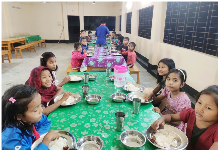
Children at Grace no longer have to worry if they will have food to eat.

Construction of Grace Children's Home started in November 2021 and now fourteen months later, it is home to seventeen precious children. Prior to moving into Grace, many of them mentioned they did not have enough food to eat on a daily basis. Several of them had attended school for a year or two while living with a relative but were not able to continue in school. All of the children are between five and nine years of age.