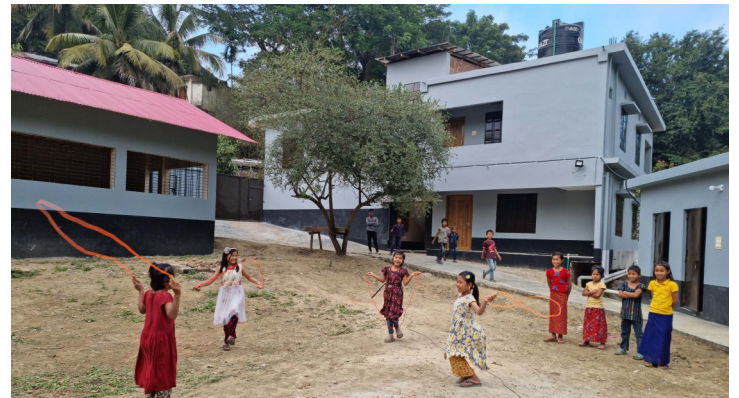
It warms my heart to see the pictures of the children playing as children should, without having to labor in fields just to eat.