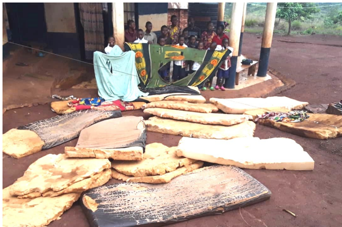
The torn and ragged blankets the children were using. Now the mattresses need to be replaced as well.