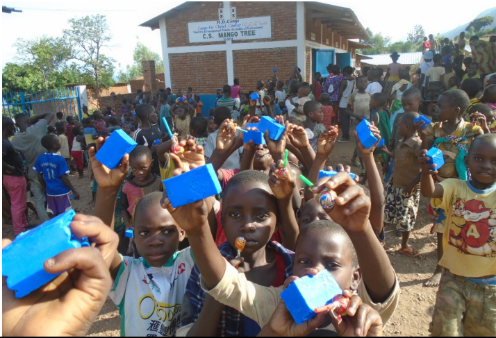
Children are excited to receive candy and soap for Christmas

There is something special and precious about celebrating Christmas with a child. I am sure you would agree, celebrating the birth of our glorious Savior takes on added wonder and joy when children are involved. Parents everywhere love to give gifts and