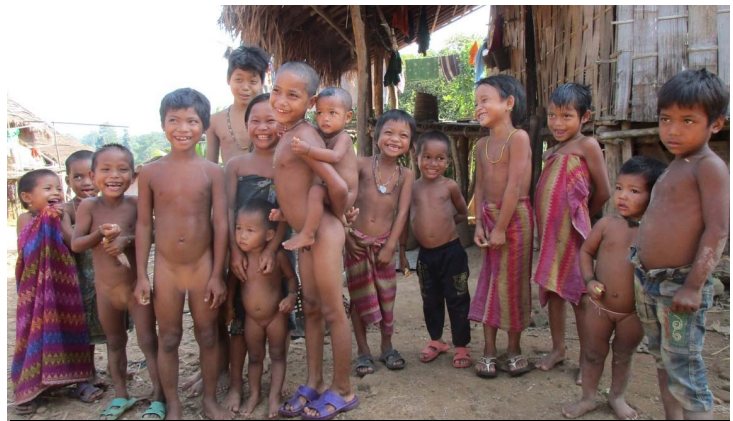
Look at the smiles your gift can bring!

In Bangladesh, they use the Christmas season to spread the Gospel to unreached villages through