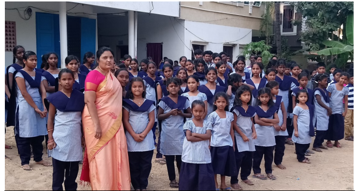
New school uniforms for orphans at Christmas in India

We are inviting you to join with us to make this Christmas just a little more special for the children we serve. In Congo, the orphans look forward to a special meal along with a Christmas worship service. The 1,200 or so children from the community who attend the feeding program at Congo for Christ will be looking forward to receiving one piece of candy and a small bar of soap. These are the types of gifts we have been able to provide for them the past two years. In addition, we provide a side of beef that allows each of them to have a small taste of meat along with their usual beans and rice. The cost for the beef, candy and soap is $675.