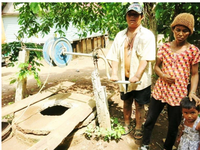
Well provides life giving water for lepers and their children

and remain forgotten in remote mountain areas. Many have lost toes and fingers making it impossible for them to work in fields. They resort to eating wild roots and leaves to survive. Even this natural resource is scarce in many of these areas.