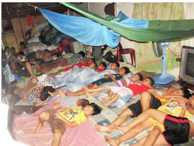
Orphans sleeping at *Bethel Orphanage

Orphans: In the July 2016 newsletter we shared that this ministry has three orphanages. We have personally visited with the staff and children of