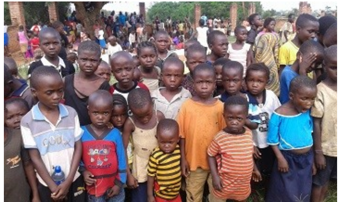
Community children are eager to be fed—spiritually and physically

staff members have made visits to homes of several of the children to follow up with help and encouragement.