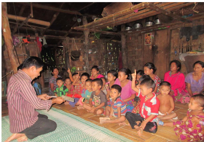
Children learn about Jesus who loves them in Sunday School

I also strongly believe in Jesus. I learnt so many things about Jesus after I go to Sunday School and attend the church. My Sunday School teacher loves me so much. I did not like to come to Sunday School and attend church before because I thought the Sunday School teacher will yell at me and other students will mistreat me. But everyone in this Sunday School is so good to me and our teacher loves me very much. We play every Sunday School and sing songs in the school. I love to play and sing a lot. I want to become a health worker in the future because people often get sick in my village and no one knows how to treat the sick.