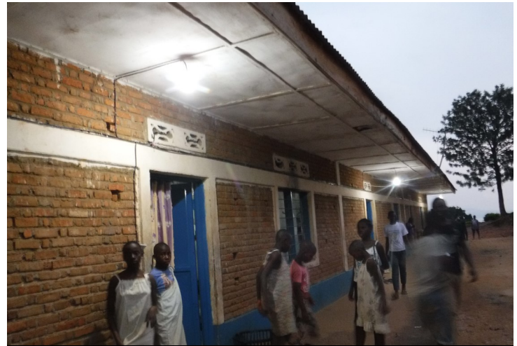
New solar power means no more stumbling around in the darkness at night...what a blessing!

In addition to the need for electricity, we became aware of much needed improvements in the children's dormitory rooms. The children have been living in these rooms for six years and renovations are desperately needed. We shared the need for new sheets and pillows and thankfully, they have been pur-